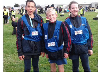
The winning team - The Tasman Tykes