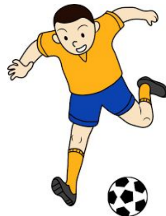
Miniball team talk