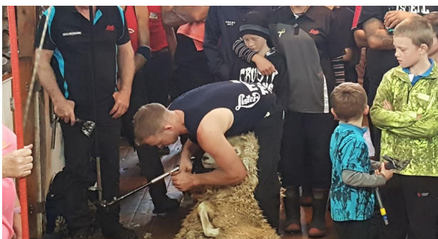
Photos from the Shear-a-thon